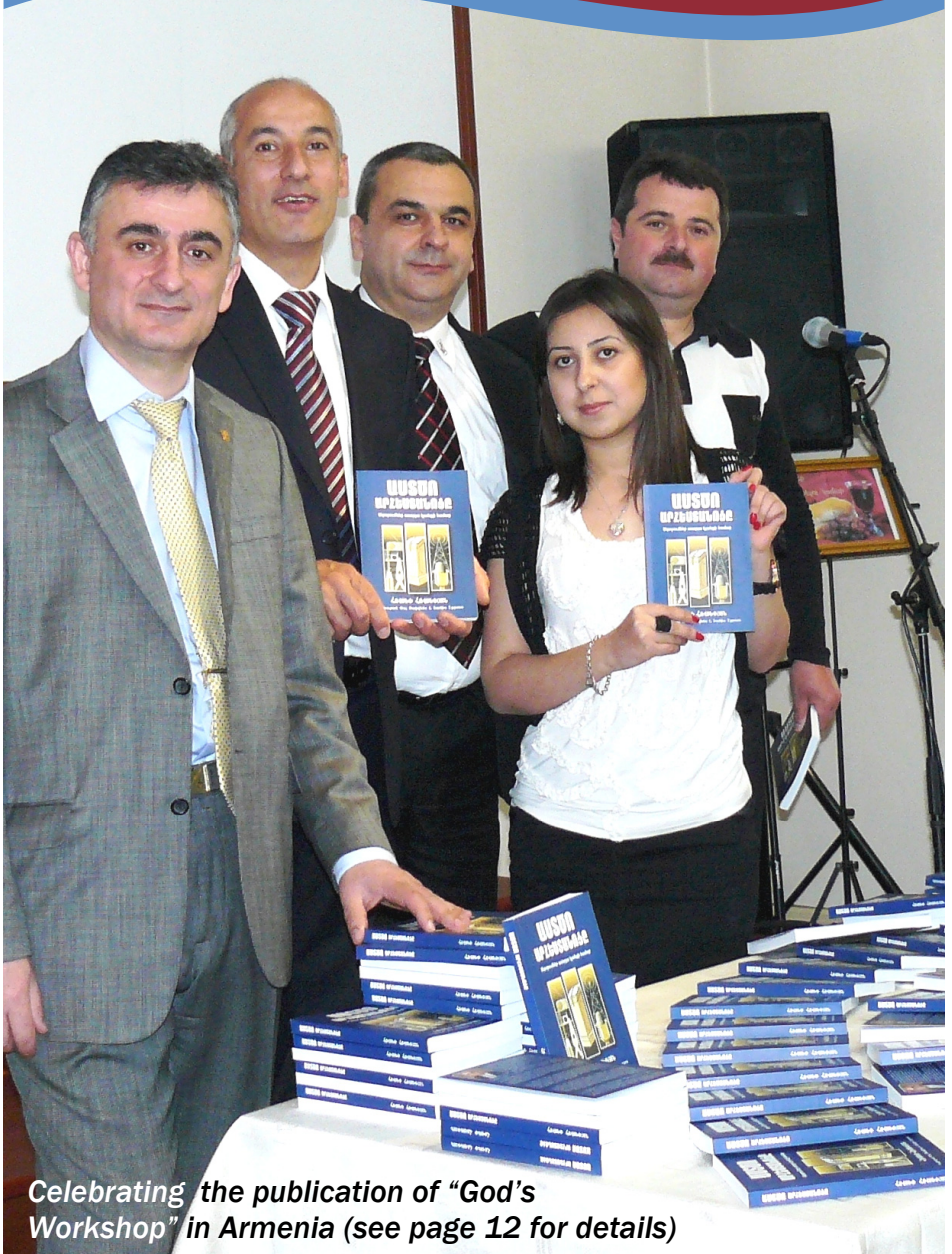
Celebrating the publication of "God's Workshop" in Armenia (see page 12 for details)

Temple Baptist Church / Good News Ministries