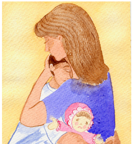
Original artwork by Stella Papadopoulos

As for my mom, she is amazing. She greets each day like the pro that she is — prompt, prayed-up, and looking marvelous. She is irreplaceable, as are all mothers, whether they are told or not.