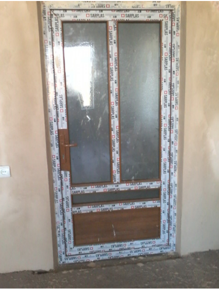
Newly installed interior door.