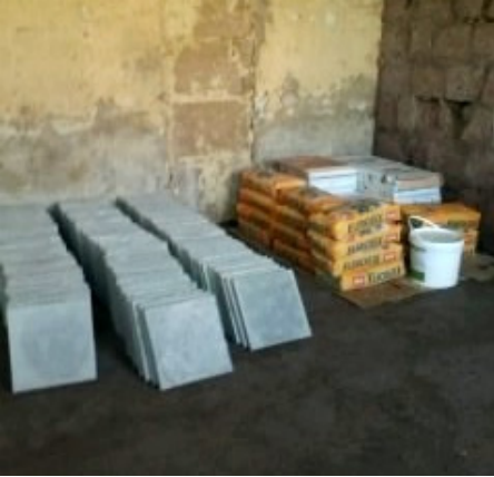
Floor tiles ready to be laid down.

It's almost finished! We'll take photos of the completely renovated church building during the upcoming trip to Armenia and share them with you soon.